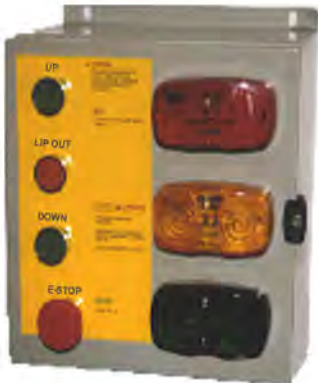
Panel illustrated with optional Traffic light system

Available in 30,000, 35,000, 40,000 lb, and 45,000lb (13,636, 15,909, 18,144 kg, and 20,455kg) Rated Capacities